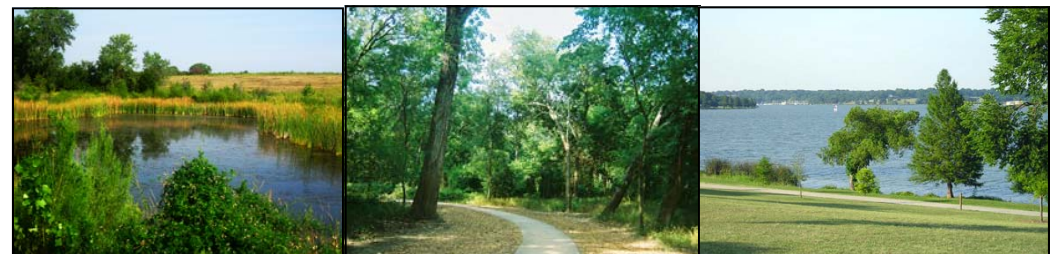
Trinity River Audubon Center