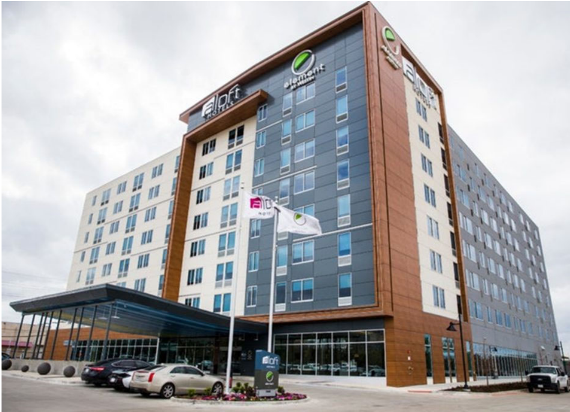
aLoft/Element - Love Field Hotel