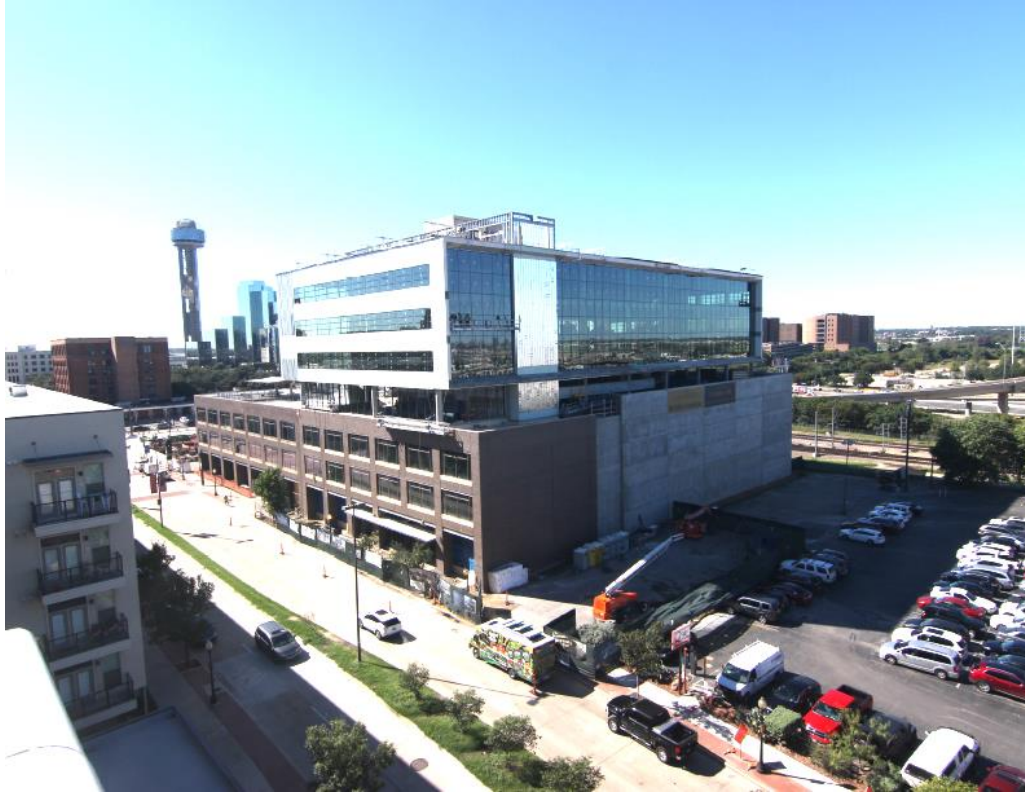
Corgan-Crescent Addition (401 N. Houston)